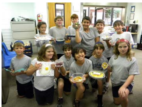
Learning about science is a lot of fun when 4th graders participate in hands on activities such as "edible" cells!

Research shows fourth graders are also good at looking hard at why things happen as they do. This trait comes in handy during social studies. Why, on our continent, is French spoken in Canada, English in the U.S., and Spanish in Mexico?