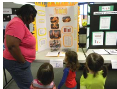
Classes had a great time visiting the Science Fair and seeing all the projects