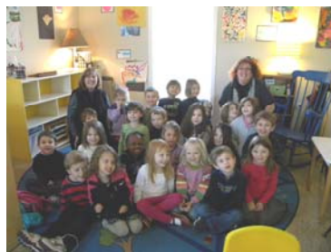
EC4 is learning all kinds of new things this year and having so much fun too!