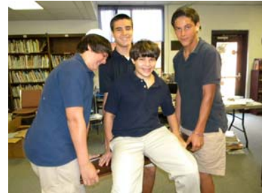
Many thanks to the 8th grade boys who worked really hard while having lots of fun!

world of the story, the excitement of ideas in essays, and more recently, connections instantly across the world through technology. It is equally exciting to see Addlestone students eagerly entering the Media Center, looking for books, listening to stories and continuing a love of learning traditional among the Jewish people, the "People of the Book."