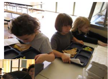
Kindergarten has been having a good time at lunch learning to go through the lunch line

ship and the children have an opportunity to be chazan or chazanit, prayer leader. We are ready for a new year of learning!